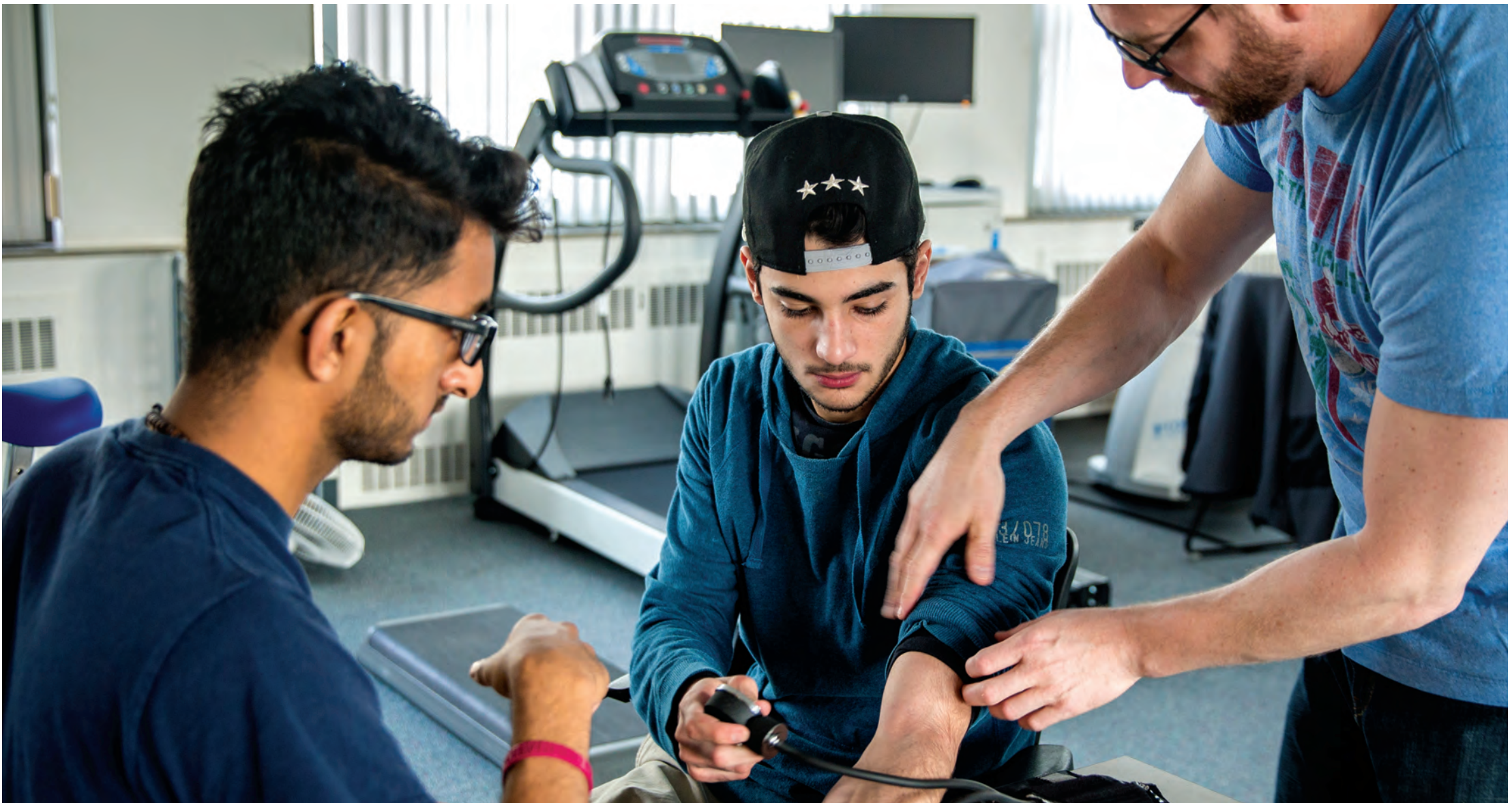
Students gain hands-on experience in Loyola's exercise science program.