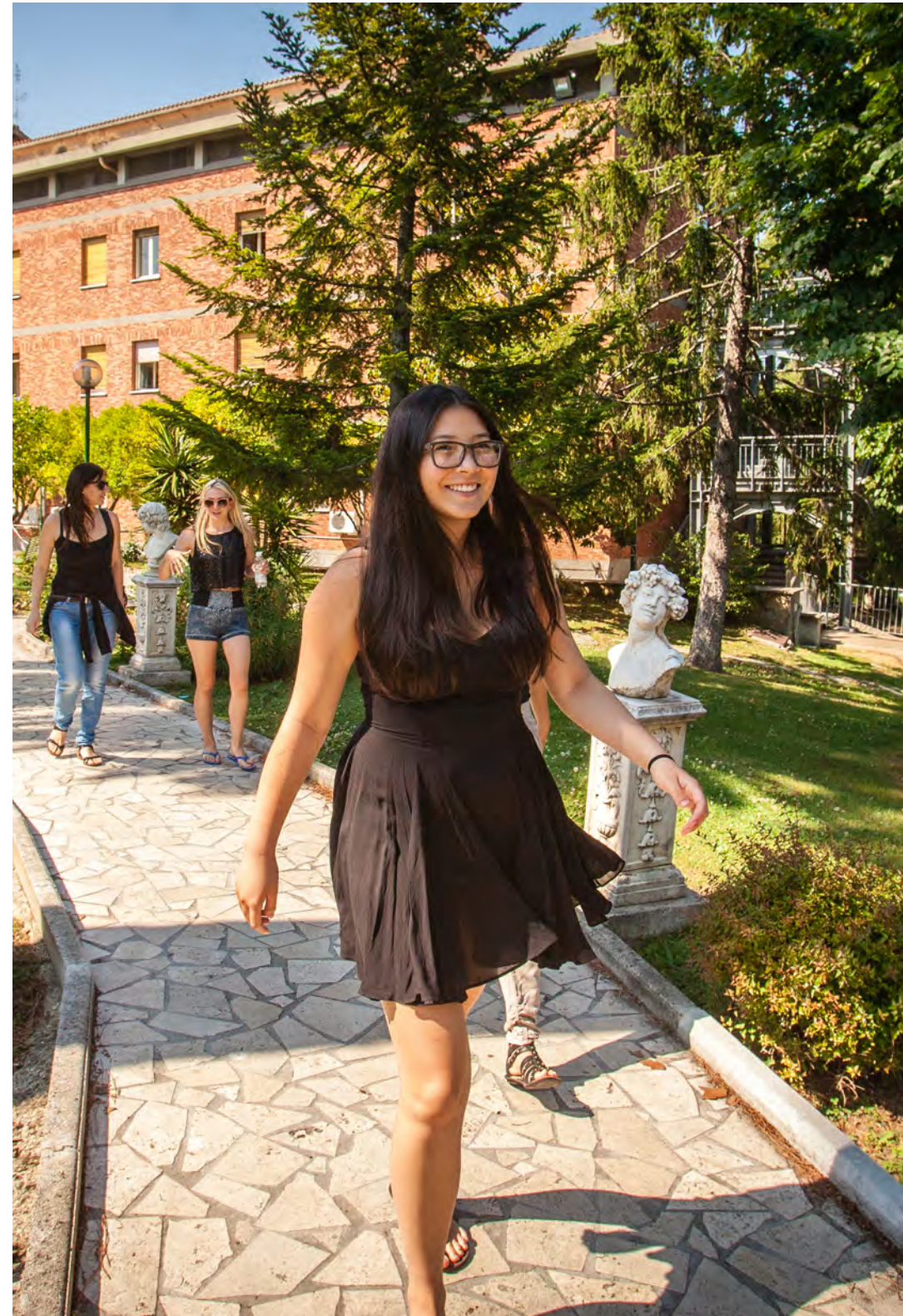
The John Felice Rome Center sits atop beautiful Monte Mario.

4 Most programs require the GRE, GMAT, or LSAT. Some require a subject test.